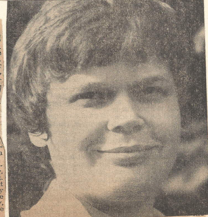
University of Akron.